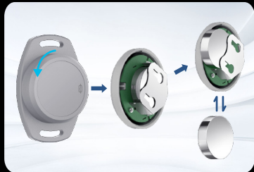
Rotating replaceable battery