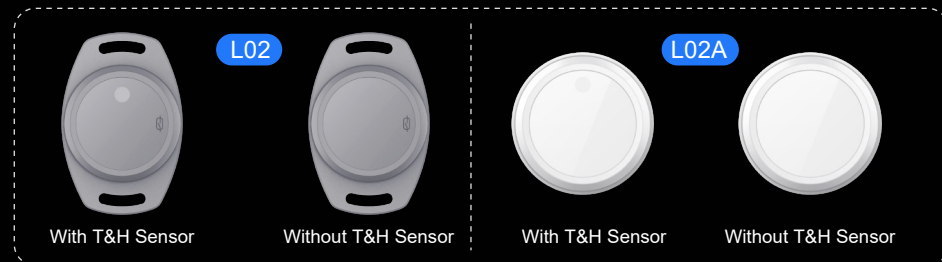
With T&H Sensor