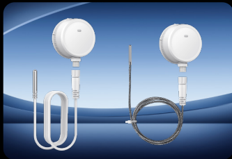
Supports diverse sensor probe