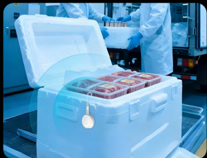
Cold Chain Logistics