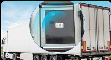
Cold Chain Transportation