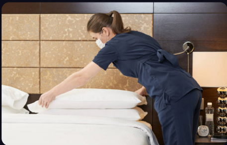
Hotel Personnel Management