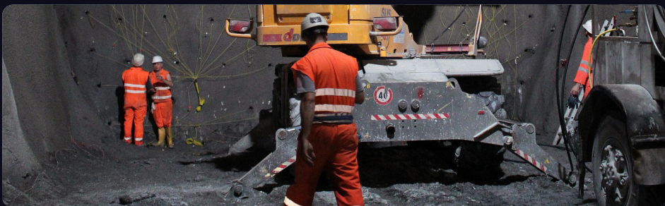
Construction Site Personnel Management