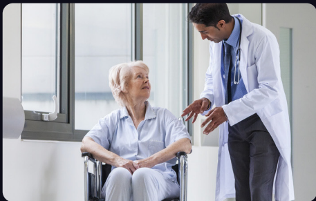
Nursing Home Personnel Management