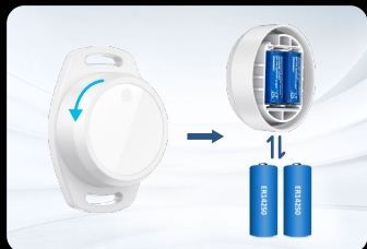
Rotating replaceable battery