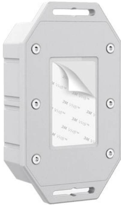
① Double-sided tape