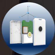
Build-in accelerometer sensor