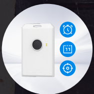
Multiple working mode