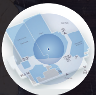
Long wireless transmission distance